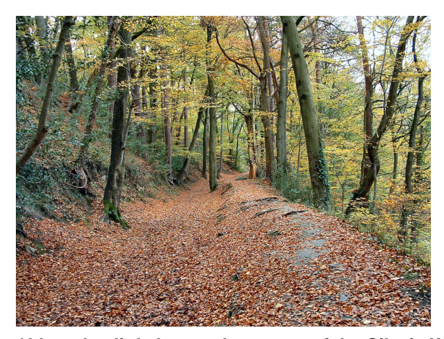
Although a little longer than some of the Cilcain Walks, you are rewarded with historic interest and great beauty.

From the White Horse Inn in Cilcain, turn right at the crossroads in the centre of the village and walk down Pentre Hill until you see a white bungalow (Hillside) on your right. Enter the Millennium Woods (Coed y Felin) on the left opposite the bungalow. Take the path into the woods forking right after about 75 yards. Carry on until you see a fence with a gap in it. Go through the gap turning right and dropping down to a stream, Nant Gain. Cross the footbridge over the stream with the ruins of Cilcain Mill in front of you.